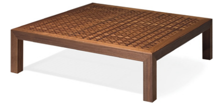
Woven wood table (120×120)

Ippongi also creates cabinets and other furniture that highlight the elegance of these techniques.