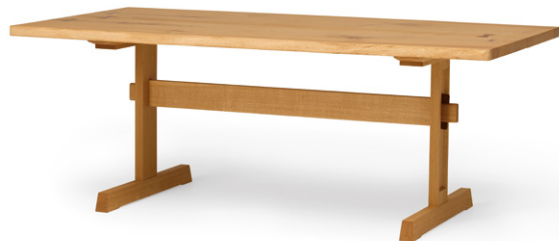
Bookmatch 2-piece tabletop 180×90 – T-shaped legs

Ippongi tables come with 3 standard leg styles, primarily for dining use. However, we also create custom pieces suited for desks, side tables, and other unique purposes.