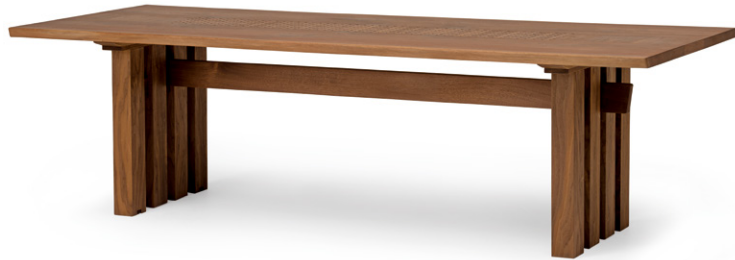
Woven wood tabletop 240×100 – Square legs