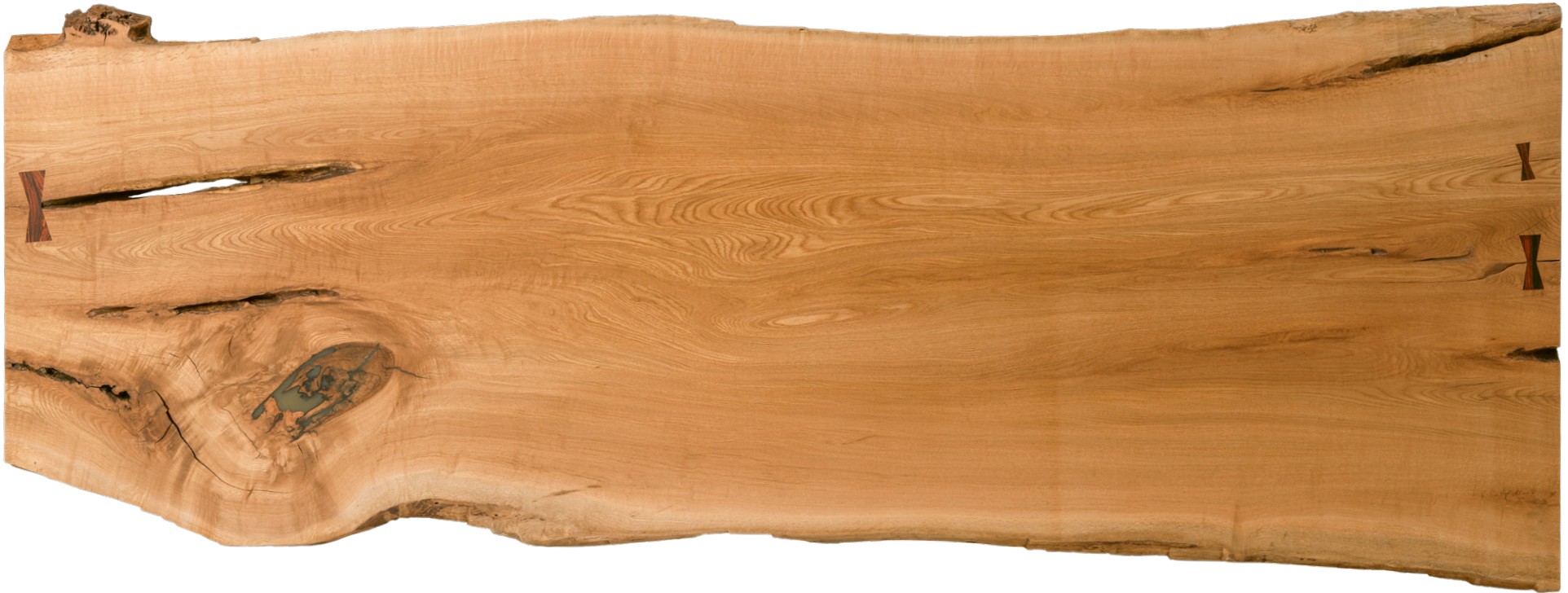
Kai tabletop 260×90

※Each "Ippongi Kai" tabletop is unique in size and character. Please consult with your representative or store for available options.