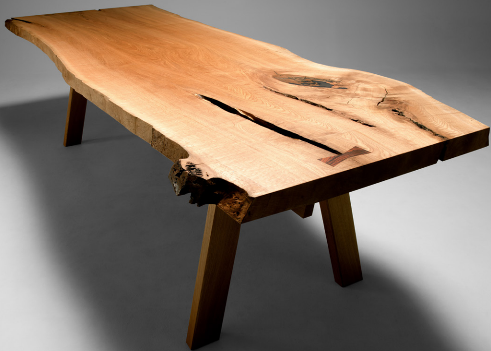
Kai tabletop 260×90 with turret legs