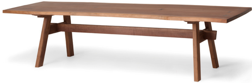
Bookmatch 2-piece tabletop 270×110 – Turret legs